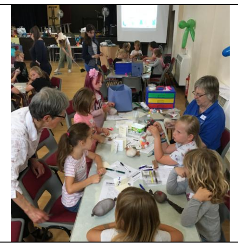
Making a seed head after hearing the story of the sower.