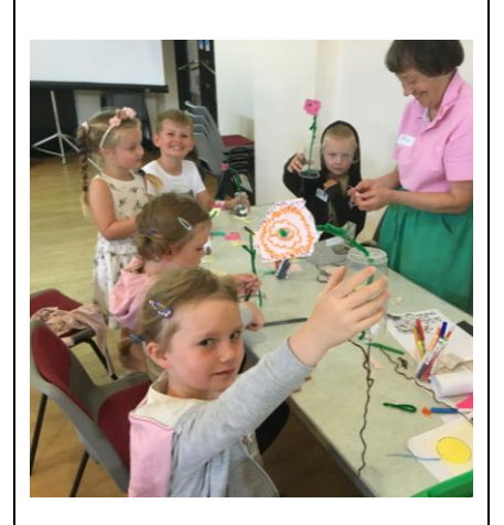
Making sure their flowers had strong roots. Are our faith roots strong?