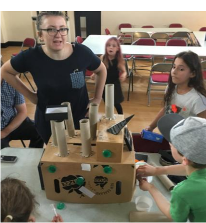
Building models. Build on the rock and not upon the sand!